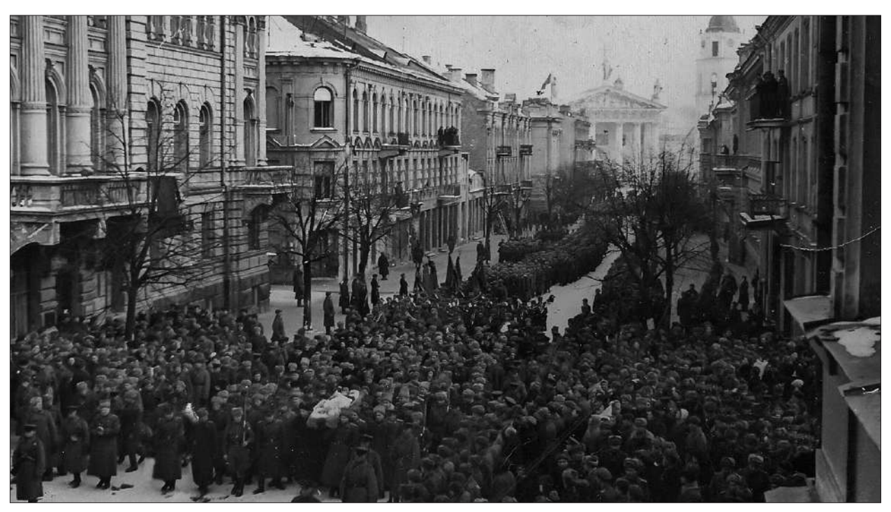
Funeral ceremony and farewell to the commander. Vilnius. 20 February, 1945.

heart. He was serious and concerned, and mentioned that if we needed anything we should freely ask for it. This we did, and he helped a great deal, for example, in getting furnishing for a Jewish children's home. <sup>12</sup>